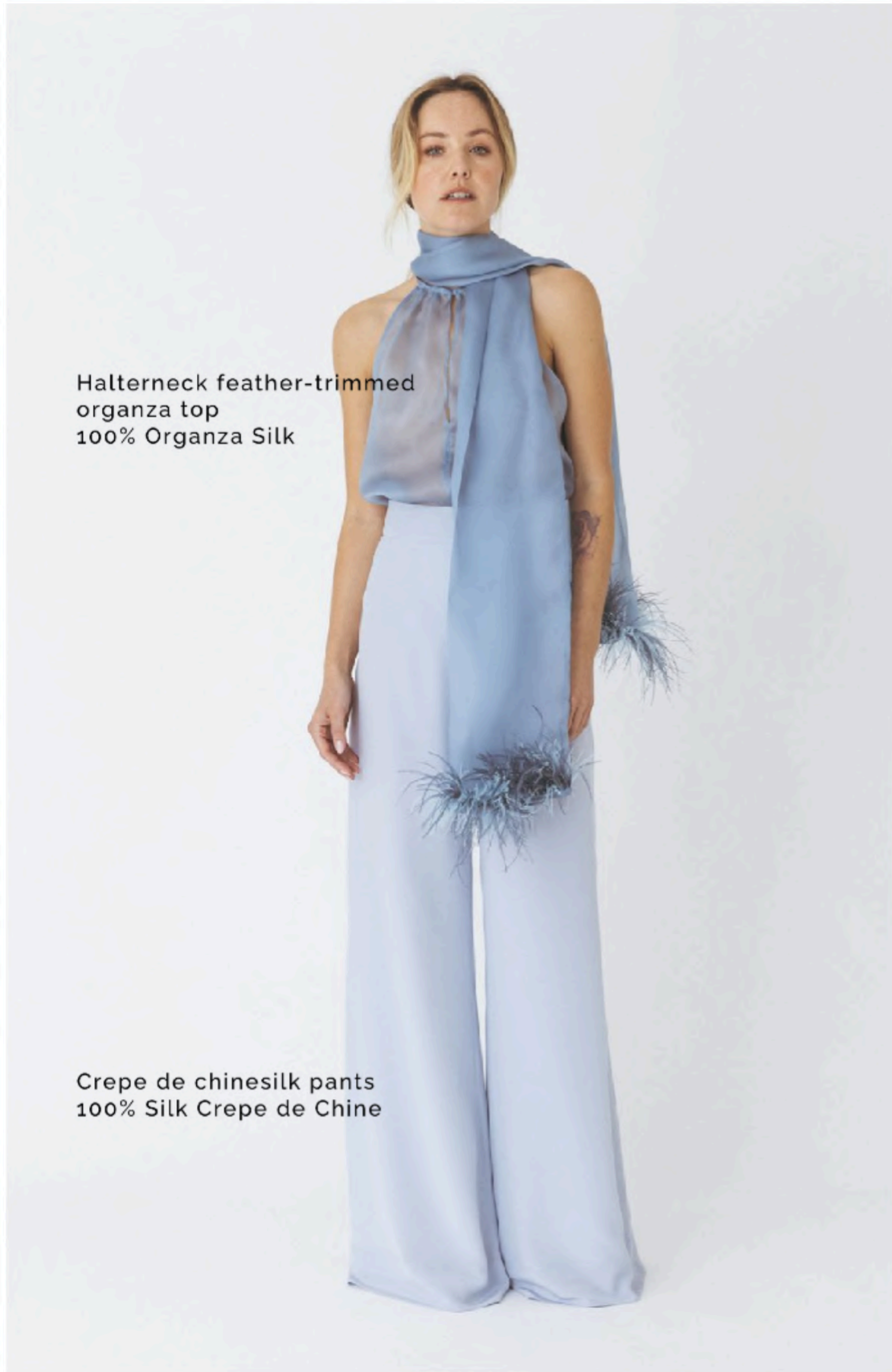
Halterneck feather-trimmed organza top 100% Organza Silk