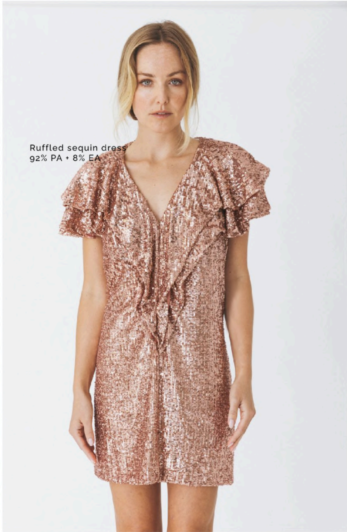
Ruffled sequin dress 92% PA + 8% EA