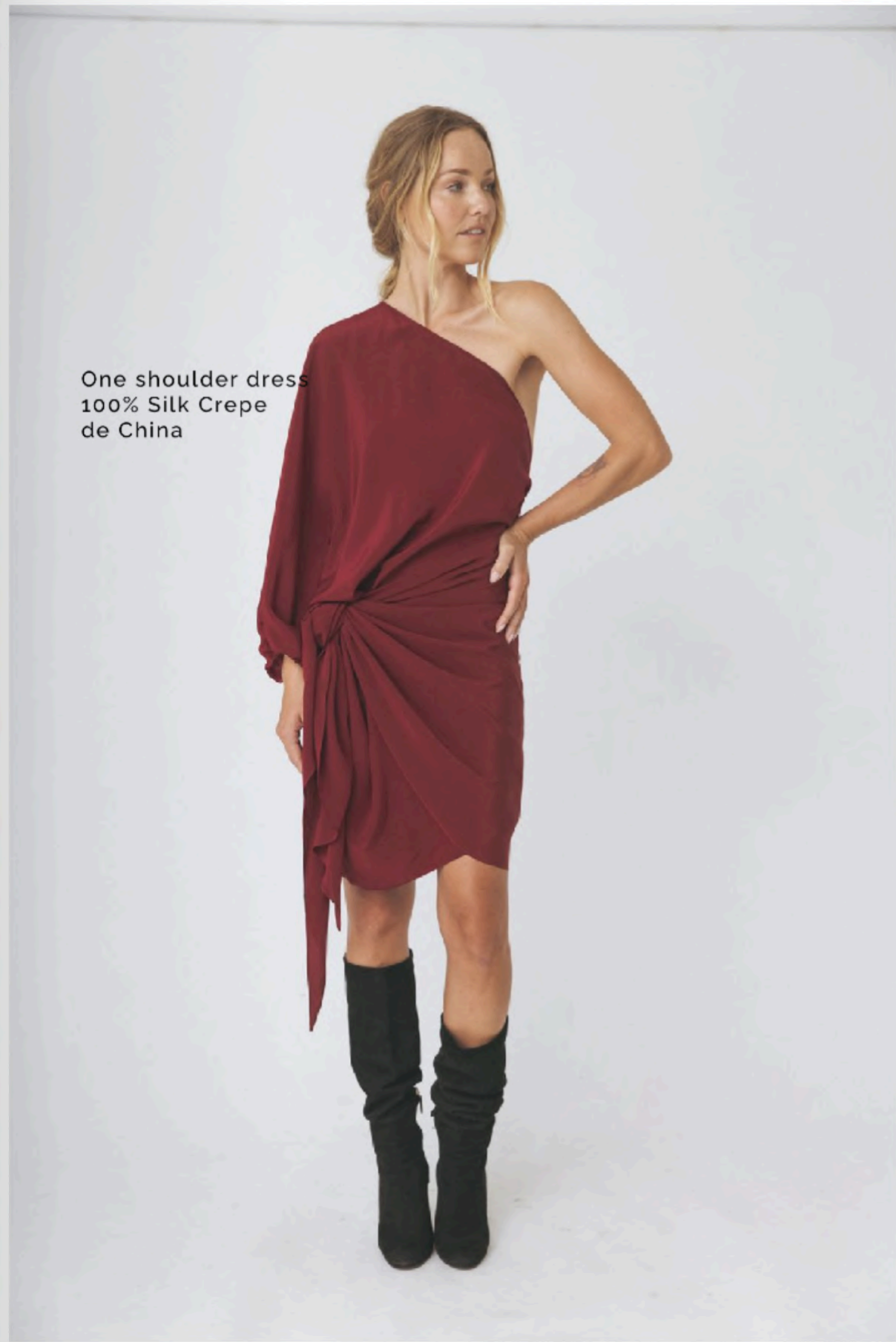
One shoulder dress 100% Silk Crepe de China