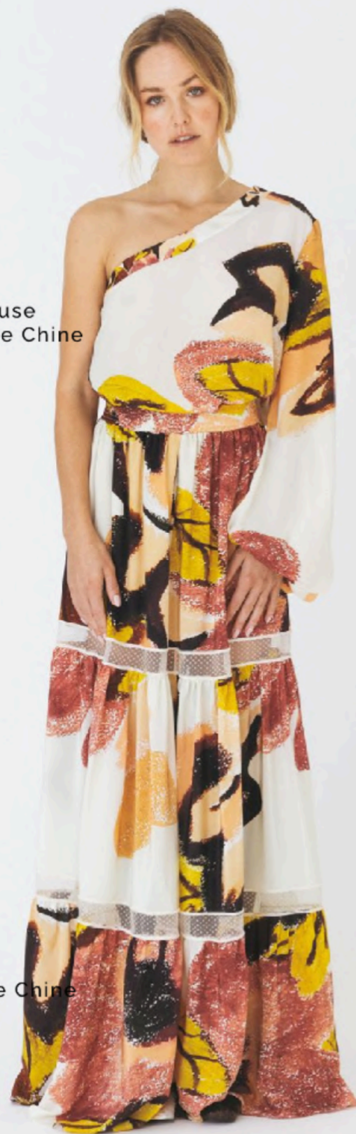
Ruffled silk skirt 100%Silk Crepe de Chine