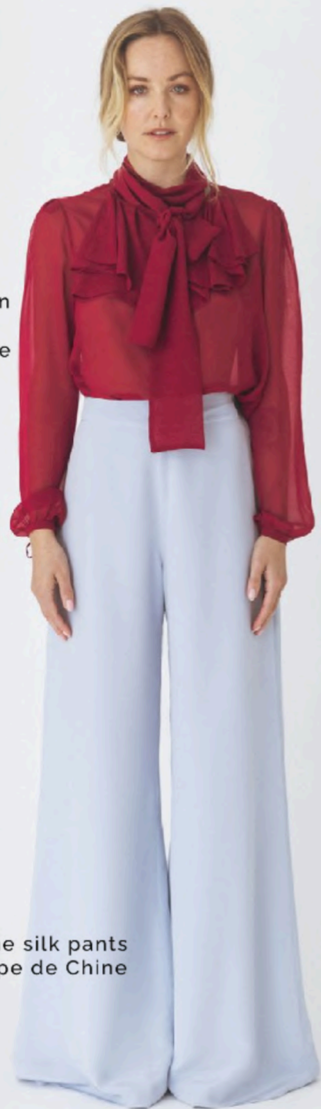
Crepe de chine silk pants 100% Silk Crepe de Chine