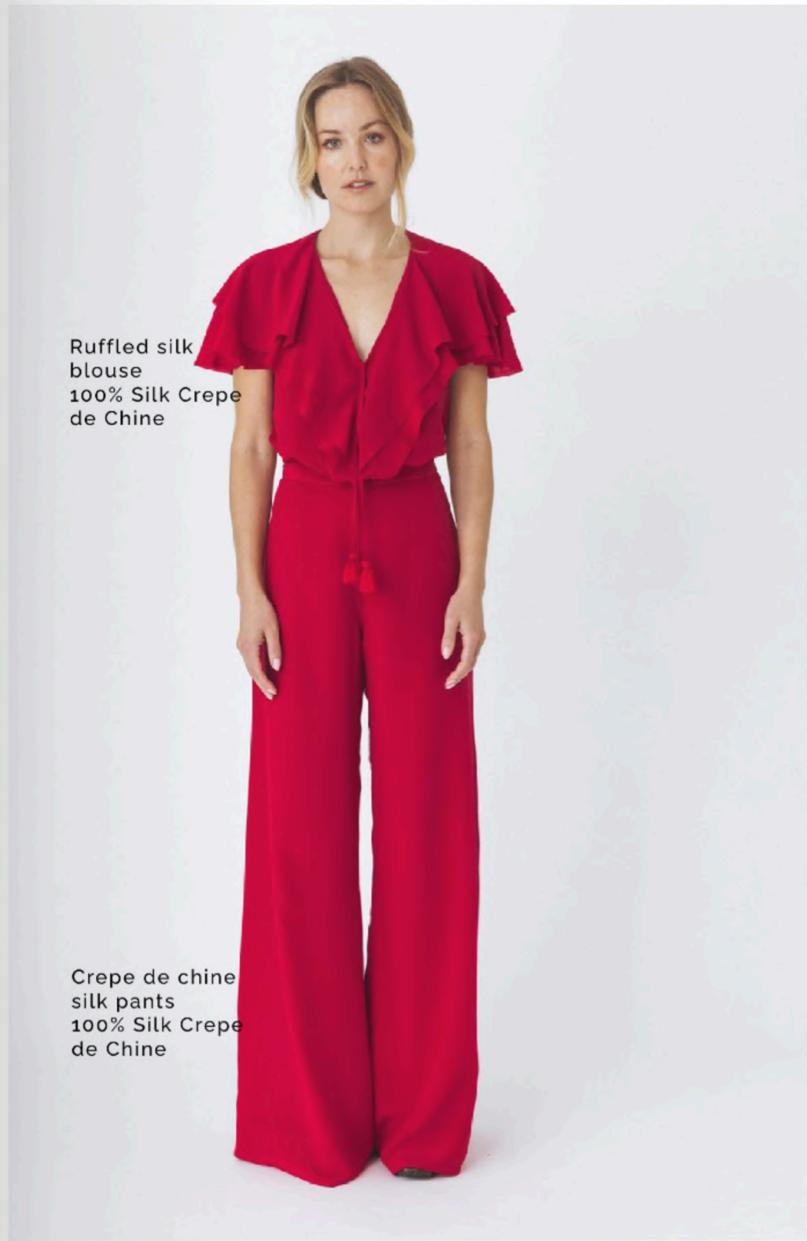
Ruffled silk blouse 100% Silk Crepe de Chine