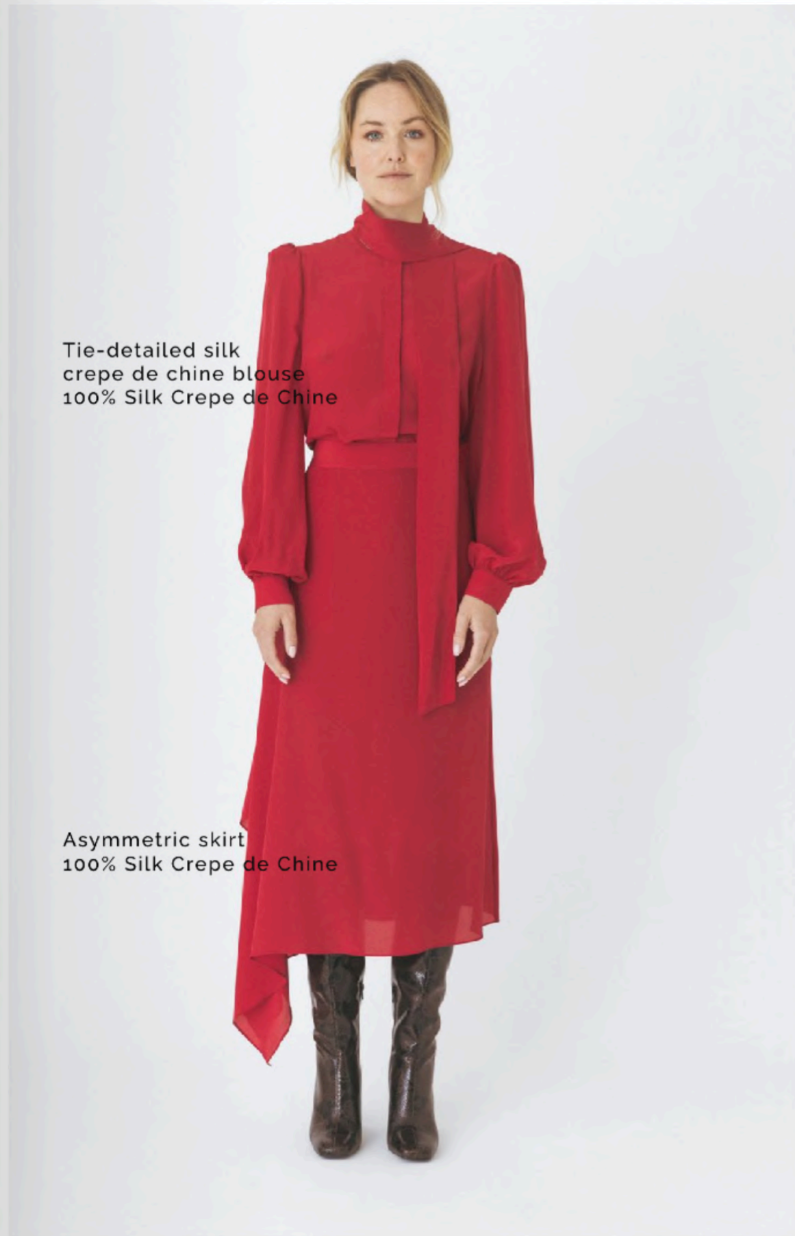
Tie-detailed silk crepe de chine blouse 100% Silk Crepe de Chine