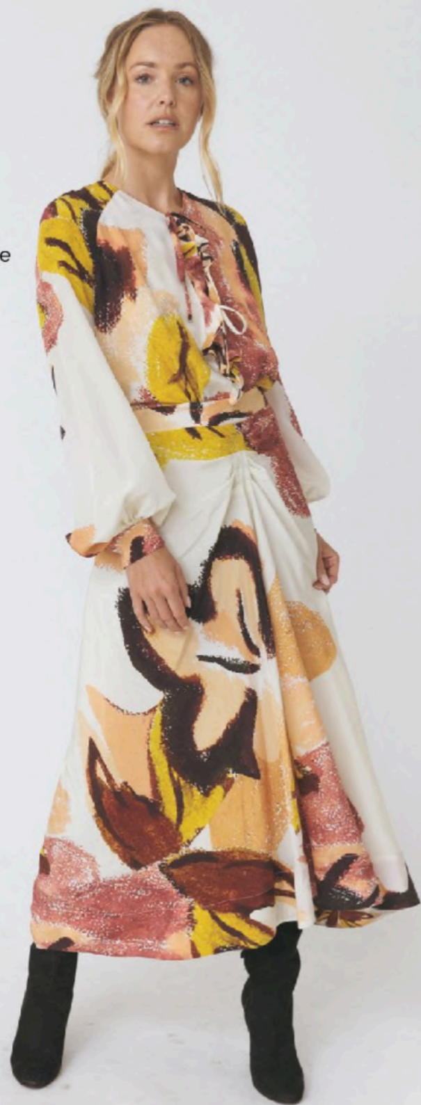
Ruffled print dress 100%Silk Crepe de Chine