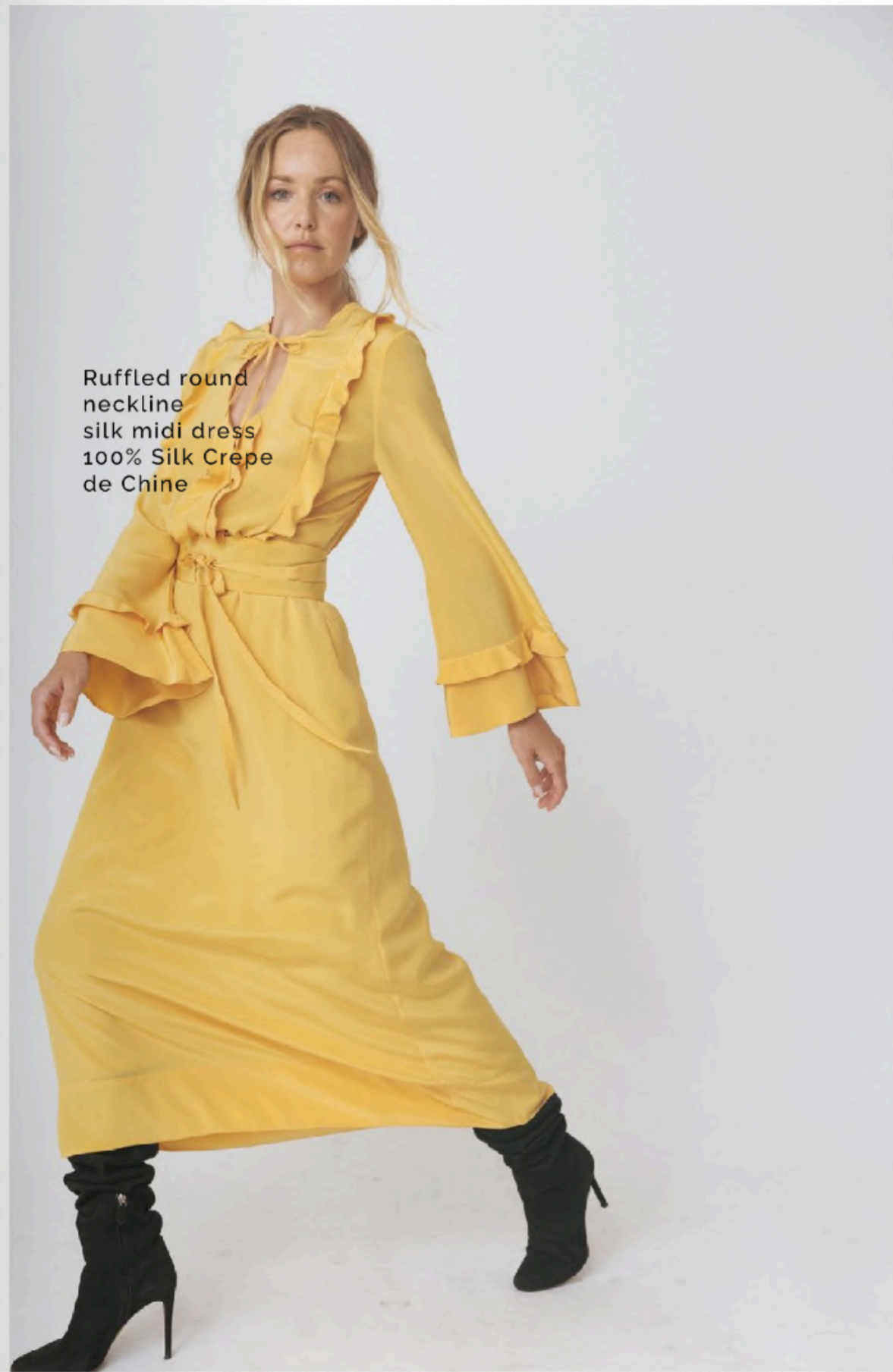
Ruffled round neckline silk midi dress 100% Silk Crepe de Chine