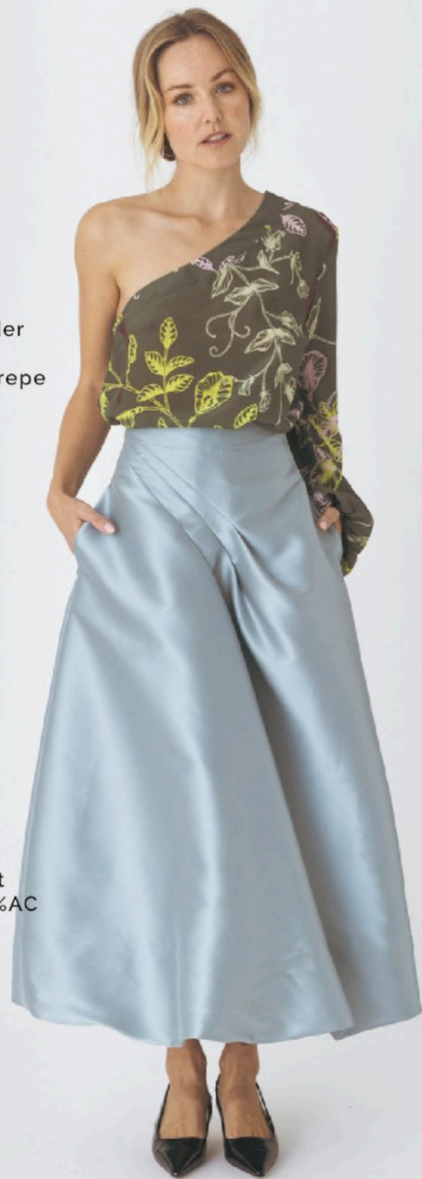
Baloon Skirt 58%Pes/42%AC