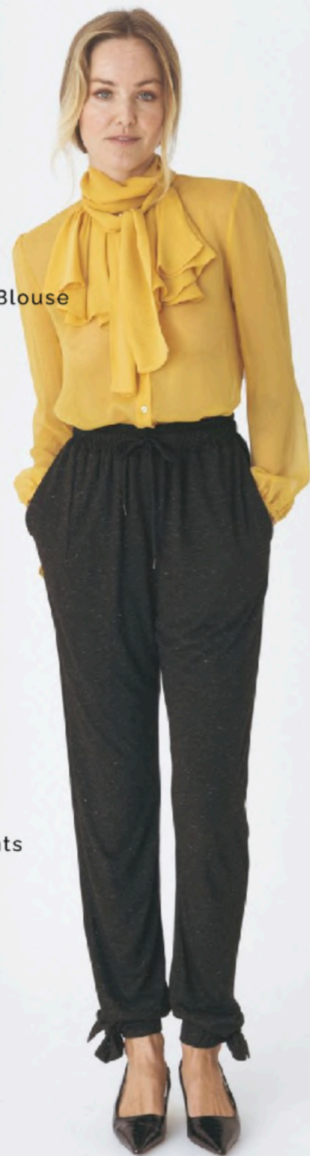
Metallic knit pants 97% CV/ 3% FM