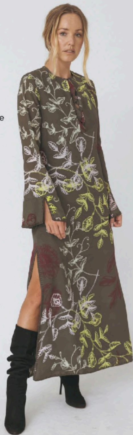
Silk print Kaftan 100% Silk Crepe de Chine